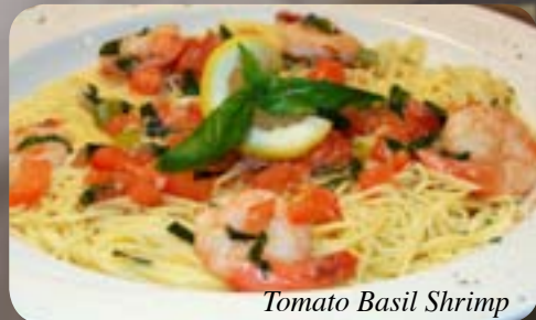
Tomato Basil Shrimp