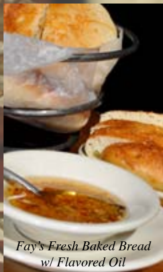
Fay's Fresh Baked Bread w/ Flavored Oil

Plan your next gathering in our private function room, please contact us at 508.997.8000 or info@FaysRestaurant.com