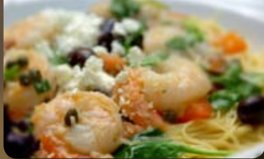
Greek Srimp Scampi