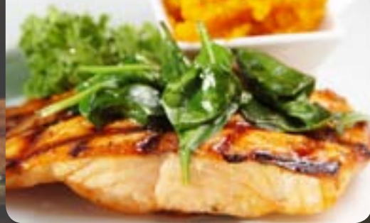
Grilled Salmon with Wilted Spinach

Our Private Function Room is perfect for all occasions from special family events to corporate business meetings.